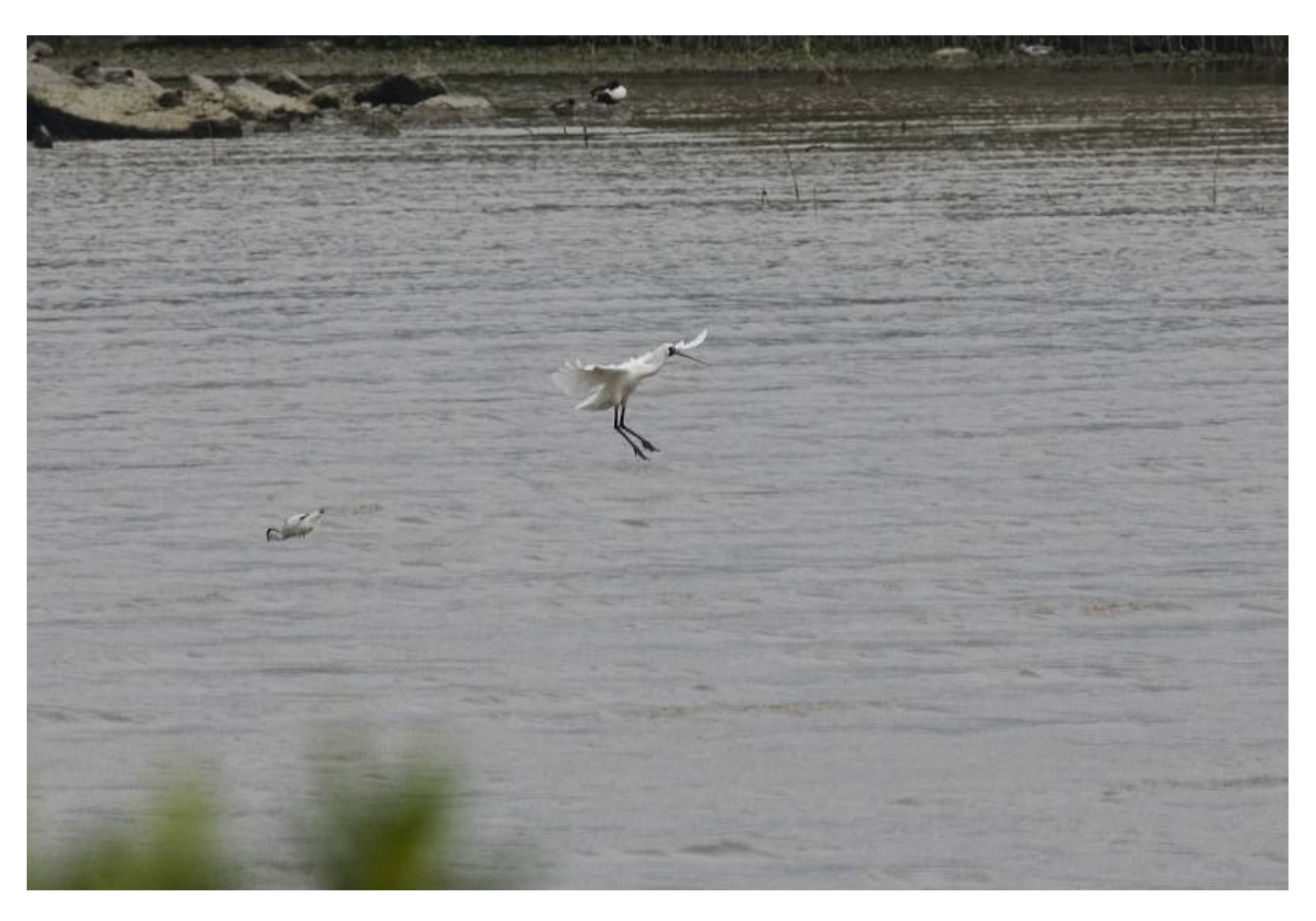
the extremely rare black-faced spoonbill